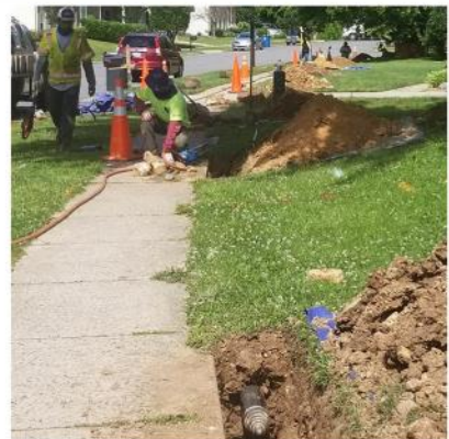
The "ground missile" (foreground) emerges after it has laid the underground pathway for new power cable along Parcher Ave.

NOVEC's service area has 175,000 customers and is mostly residences. It includes other Fairfax communities in the Centreville area and those in neighboring Loudoun and Prince William counties. NOVEC is among the largest U.S. not-for-profit electric companies. It routinely receives high customer satisfaction ratings. Investor-owned utility giant Dominion Energy powers the rest of RHA.