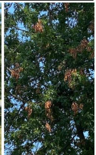
17-Year Cicada Damage to American Dogwood tree (left) and oak tree (right).