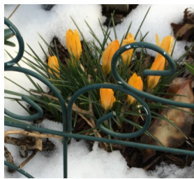
Three days after the meeting it snowed 4" & the temp. dropped to 17 degrees.

-- Edwards reported that the new replacement pool furniture should be arriving in about a month, ahead of the May 28 opening date for the summer pool season.