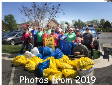
Photos from 2019