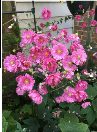
Fall-blooming Japanese anemone

Take a walk in the park....The sunny tree pictured on page 1 is in the south end of our park, near where the 3rd stream bridge used to be.