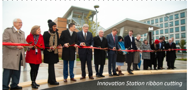
Innovation Station ribbon cutting